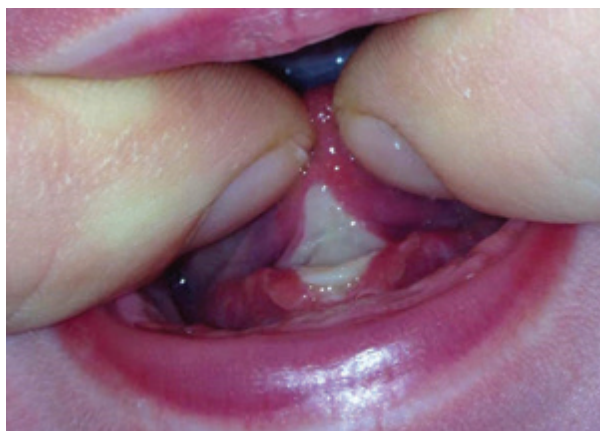
Figure 8. The white patch is the wound site indicating that the release has been accomplished.

Frenotomy for ankyloglossia is medically necessary when newborn feeding difficulties exist. The laser can help make frenotomy treatment significantly less traumatic for both patient and parent. Healing is expedited and usually uneventful.