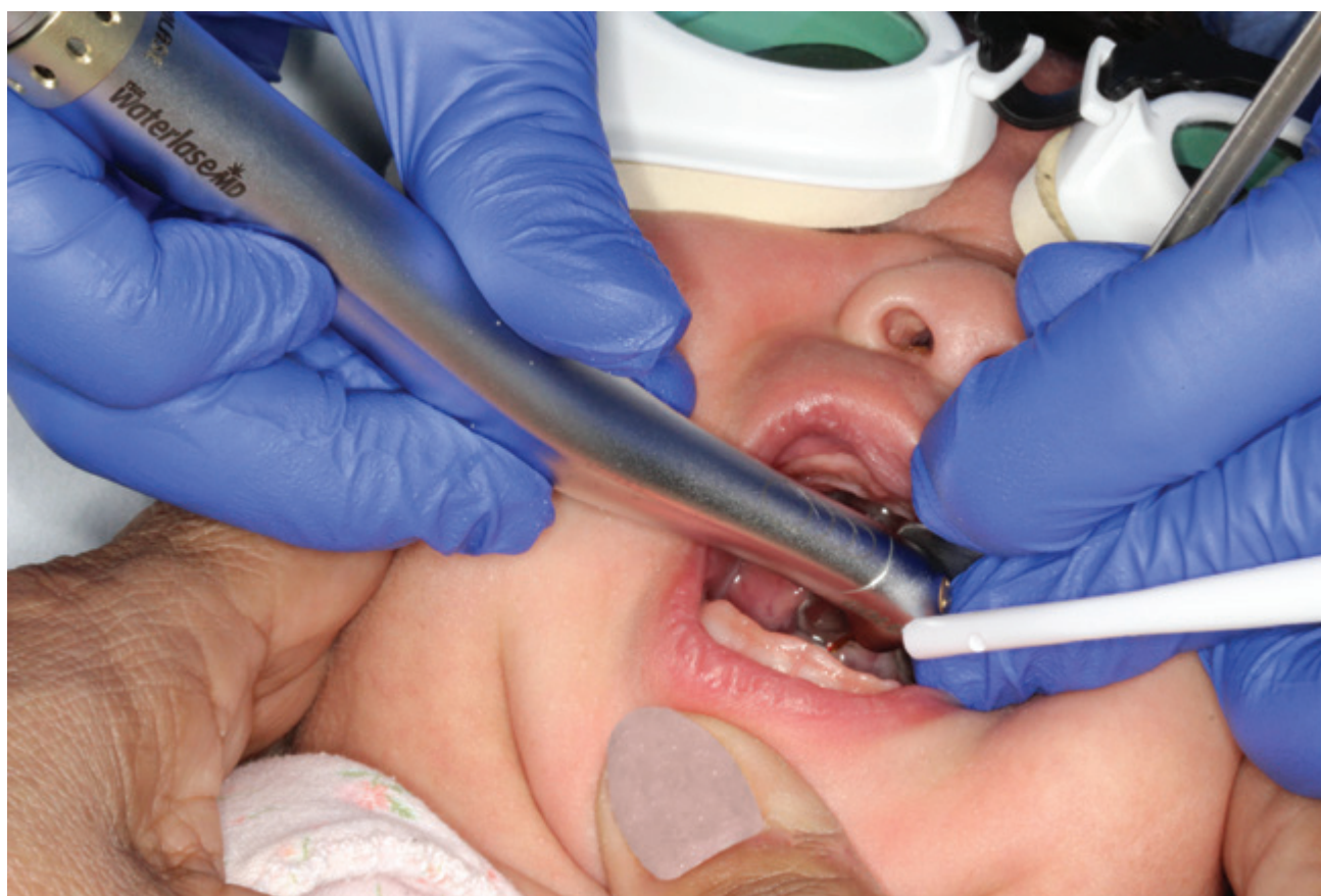
Figure 4. The clinician performs the frenotomy with the laser, while managing the patient's tongue with a grooved tongue director. The dental assistant manages aspiration, while the parent (pictured gloveless) works together with the clinical team to manage patient mobility.

After the laser procedure, the release was observed and the patient's tongue could be lifted to the upper ridge without restriction. In resting position, the tongue was flat and there was no more pull from that area to the floor of the mouth.