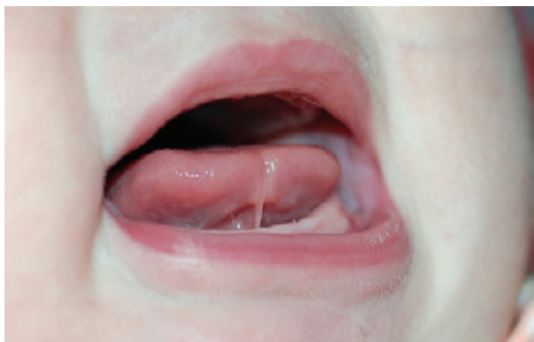
Figure 1. Example of tongue posture.

A four-week old healthy, full-term female presented with Type III ankyloglossia based on the Coryllos classification. This is described as thick, fibrous, and not elastic frenulum; the tongue is anchored from the middle of the tongue to the floor of the mouth. Although the tongue could extend past the lower ridge, the tongue posture was never elevated, even during crying. Functional clinical criteria either observed or reported by the mother included shallow and unsustained latch, “gumming” at the nipple, gassiness, colic and reflux. There was also a report of maternal pain during and after nursing and that the baby also had difficulty feeding from a bottle.