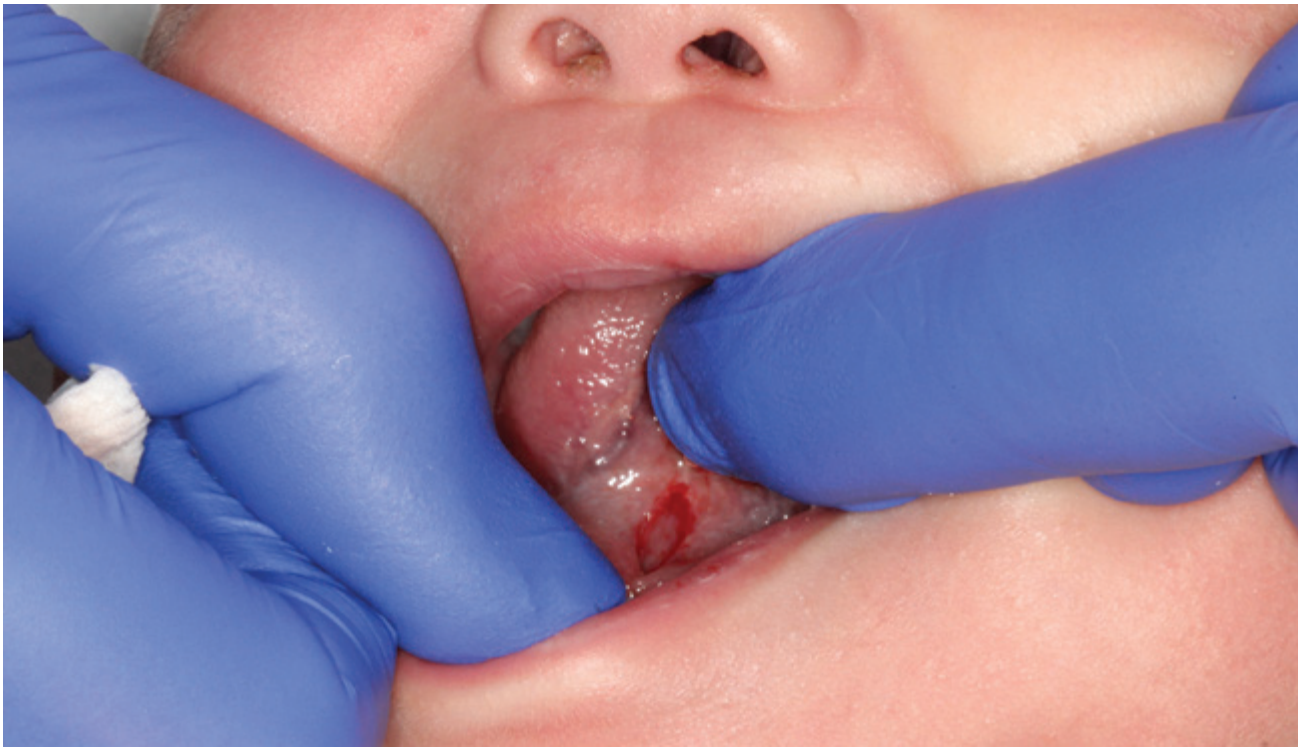
Figure 6. Post op, the tongue is released. Wound care exercises shown with one finger on tongue and one on ridge.