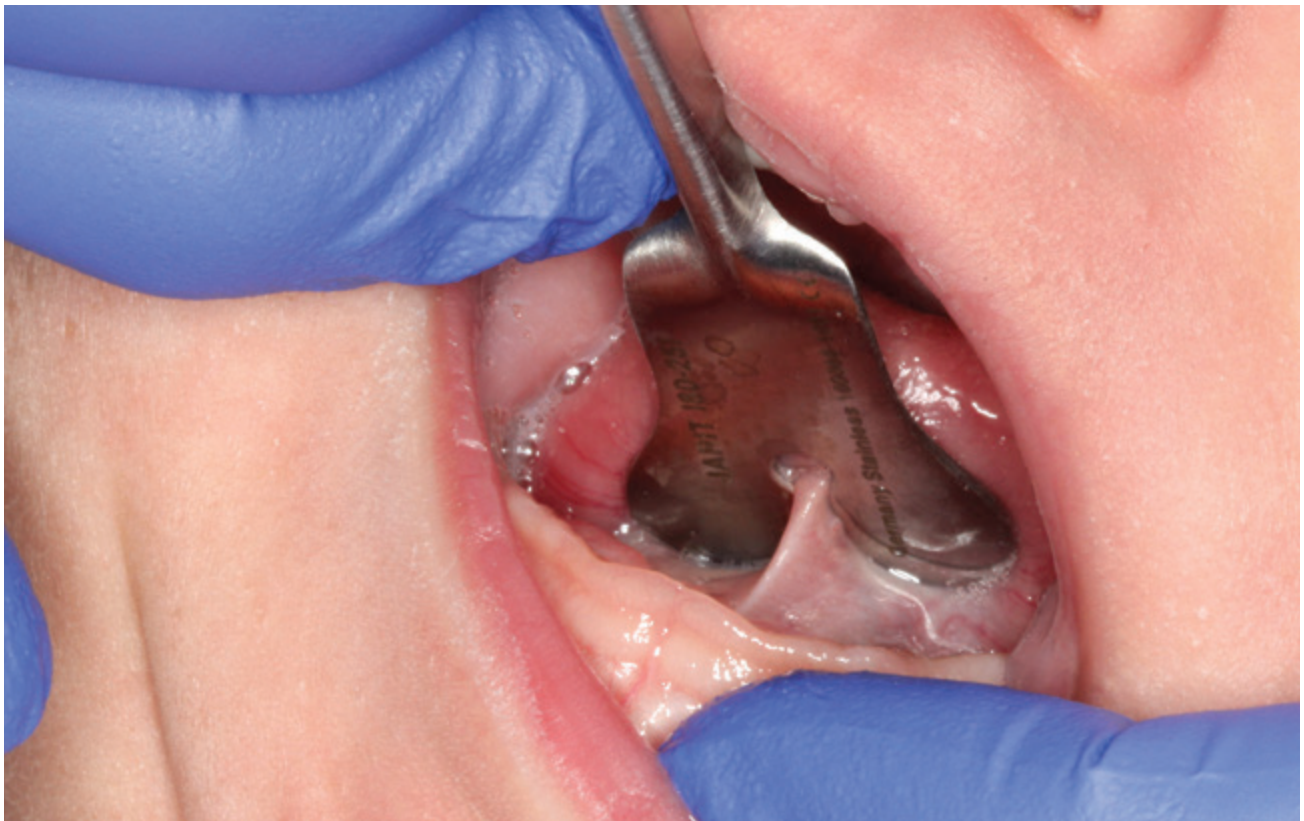
Figure 3. Type III ankyloglossia: A grooved tongue director allowed the operator to access the area and demonstrate the problematic area to the parent.

Although a scalpel, scissors, electrosurge or diode laser could be utilized to perform the frenotomy, the Er,Cr:YSGG laser was selected for its ability to rapidly ablate soft tissue, along with an associated analgesic effect, hemostatic capabilities and minimal patient discomfort. The Er,Cr:YSGG laser has the capability of keeping the target tissue cool and relaxed while cutting rapidly; this is accomplished via a combination of water-cooling and pulsing of laser energy. Er,Cr:YSGG lasers help make frenotomy treatment significantly less traumatic for both patient and parent. Healing is faster and usually uneventful with the laser and there are no sutures to be removed from scalpel or scissor use.