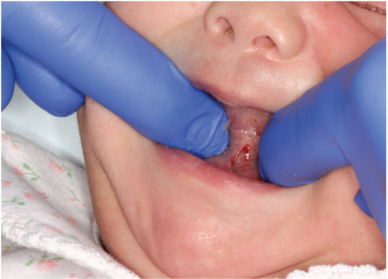
Figure 5. Immediately post-op. No hemostatic agents were required. This is the bleeding in its entirety showing how minimal it was. Wound care exercise shown with two fingers

Stretching exercises were performed immediately after the procedure. Stretching the tongue starts the healing process and provides muscle memory to the area. A thorough explanation and demonstration of stretching exercises was given to the parent, and the importance of the exercises to prevent reattachment was emphasized. The patient was discharged after she showed function.